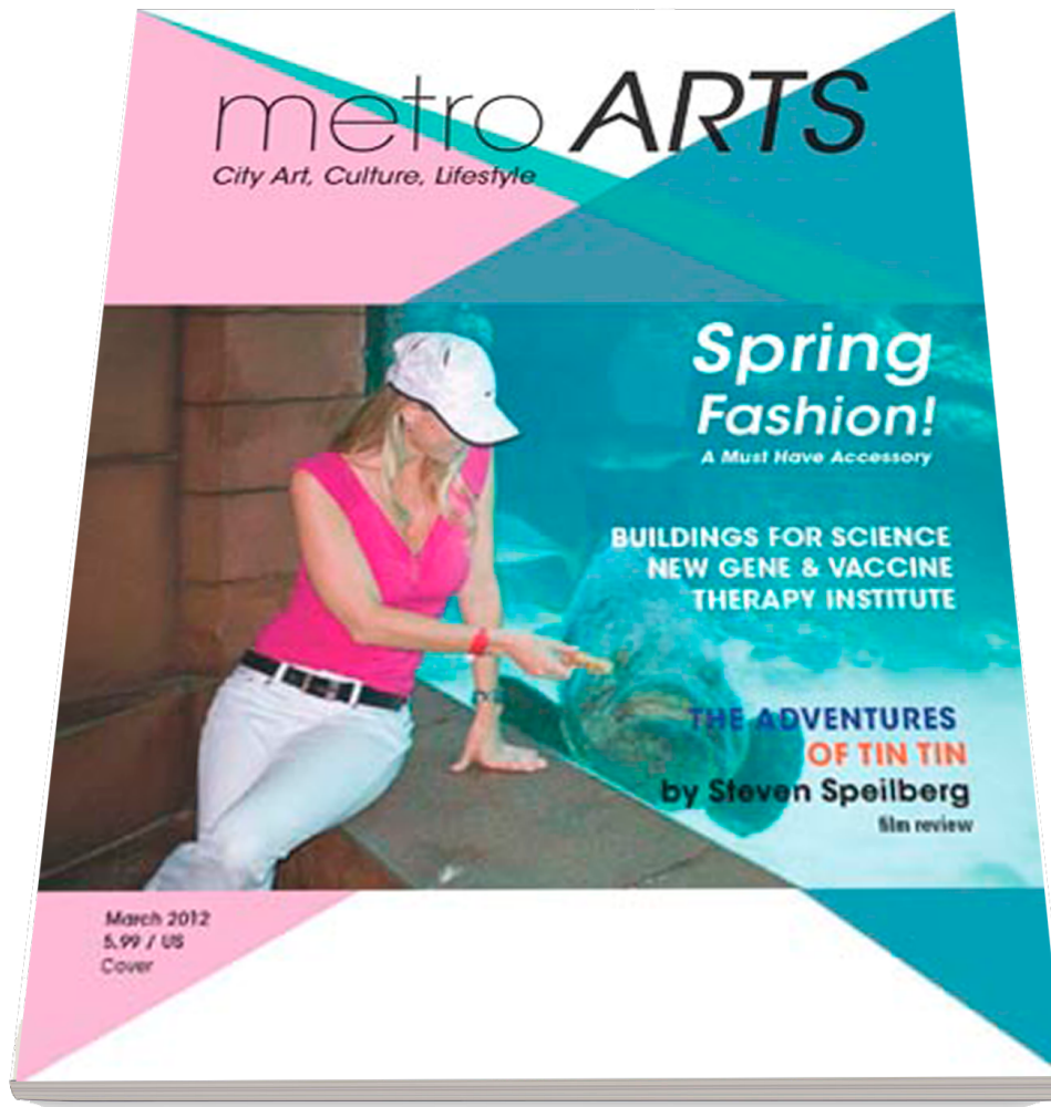
METRO ARTS MAGAZINE | FRONT COVER

“Metro Arts” a 6 page magazine devoted to city art, culture and the life style of Palm Beach and The Treasure Coast of Florida. All photography is original and editorial copy is credited where appropriate. Covers arts include music, wedding, architecture & movies.